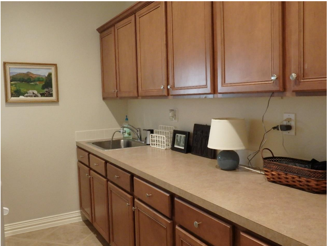
The laundry room at the end of the hallway is large enough to house a second refrigerator, washer, dryer, and has loads of cabinets.